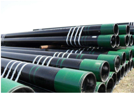
OCTG API 5CT casing K55