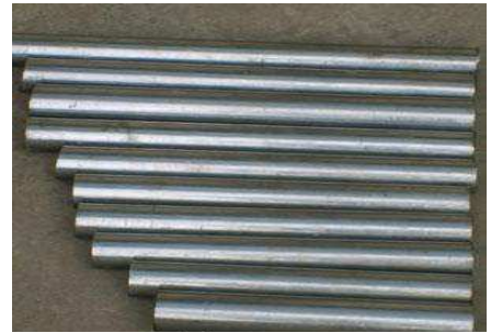
Auto precision pipe ST52