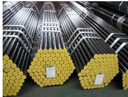
Seamless steel pipe API 5L X42