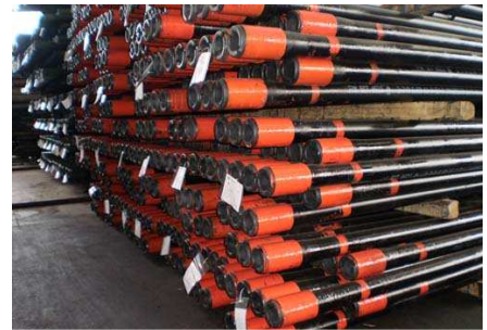
API 5CT tubing N80-1