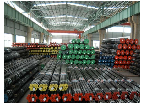
Seamless pipe API 5L X42/X46/X52