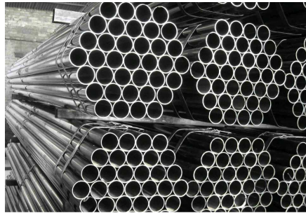
High intensity structural tube