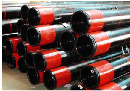
API 5CT casing pipe N80-1