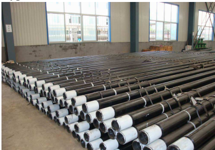
API 5CT tubing P110