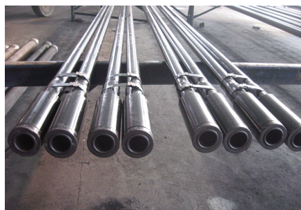
API 5DP Drill pipe G105