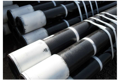
API 5CT casing pipe P110