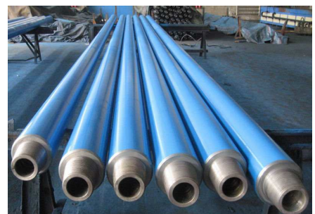
Heavy weight dill pipe