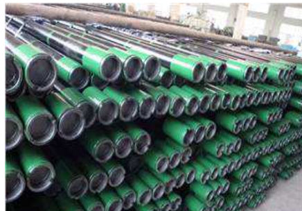
OCTG API 5CT tubing J55