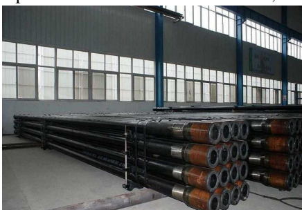
API 5DP Drill pipe G105

Operative Standard: API SPEC 5DP, API SPEC 7