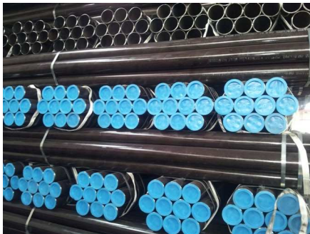
ASTM A106/A53 GrB/API 5L GrB